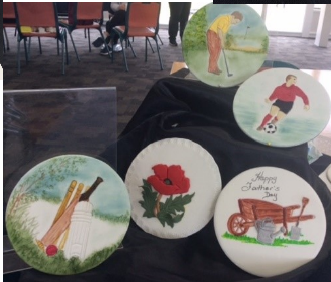
Sylvia's Patchwork Cutters for Father's Day