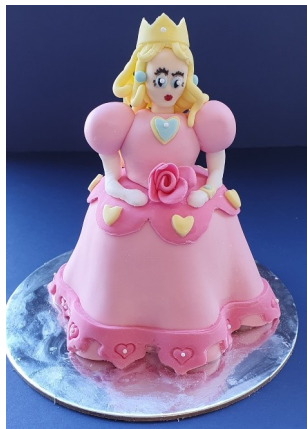
Juniors Competition work from July