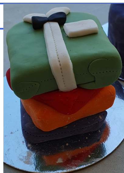
September Junior's work